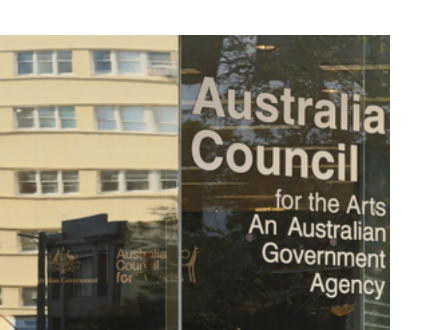
APRIL 4, 2020 CLASSICAL MUSIC, DANCE, THEATRE, VISUAL ART ARTS SECTOR REELING AFTER