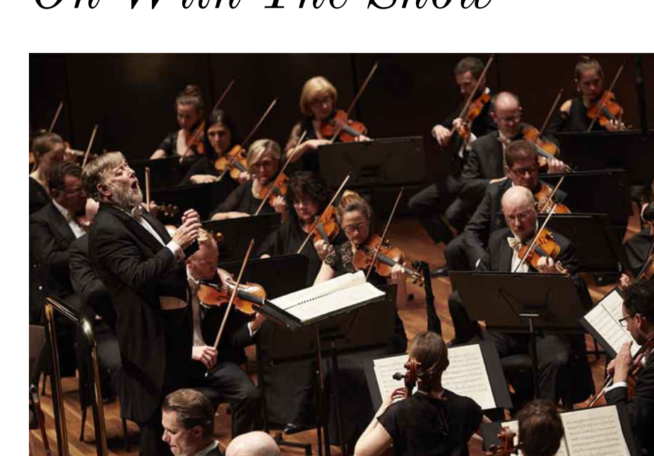
THE ARTS AT HOME

Limelight is here to help you stay connected with the arts. Find out what's happening online this week.