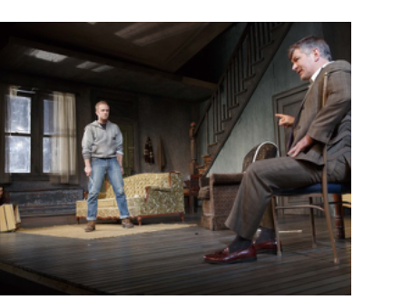
ALEC BALDWIN JOINS