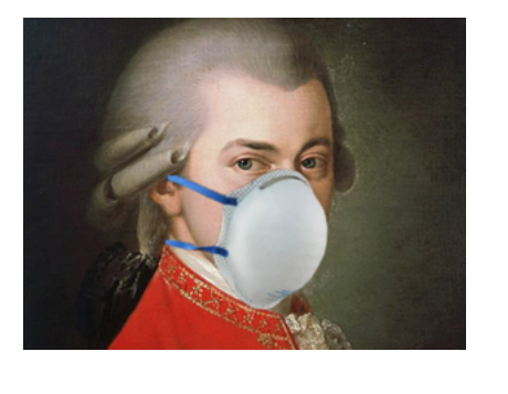
CLASSICAL MUSIC THE TEN GREATEST SELF-ISOLATING COMPOSERS