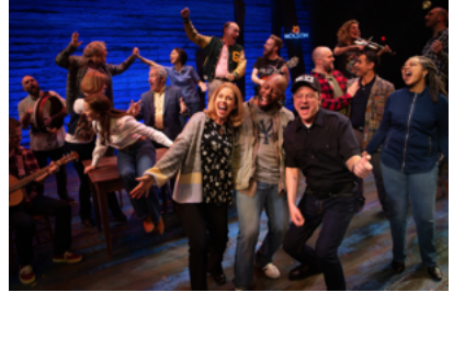
DANCE, MUSICAL THEATRE & CABARET, OPERA, THEATRE THE 37TH GREEN

ROOM AWARDS PRESENTED AT ONLINE CEREMONY