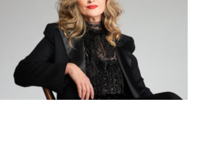
DANCE, OPERA, THEATRE, VISUAL ART AUSTRALIAN ARTISTS