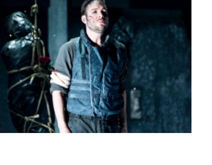
APRIL 8, 2020 CLASSICAL MUSIC, OPERA, THEATRE, VOCAL & CHORAL DEGRADED AND DEMORALISED: THE ARTS COMPANIES