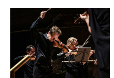
APRIL 4, 2020 CLASSICAL MUSIC THE AUSTRALIAN CHAMBER