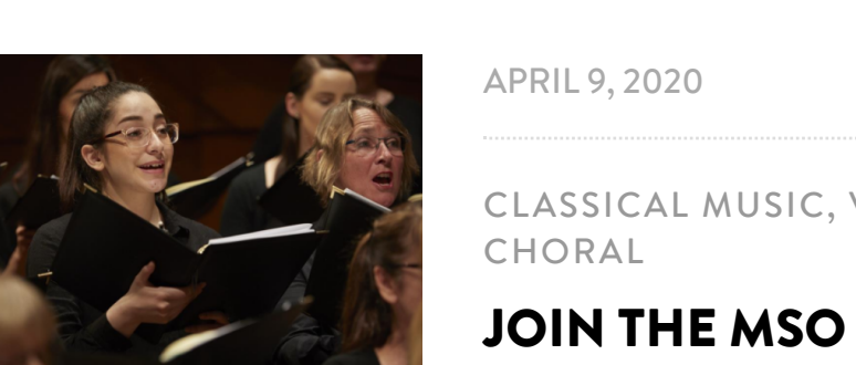
APRIL 9, 2020