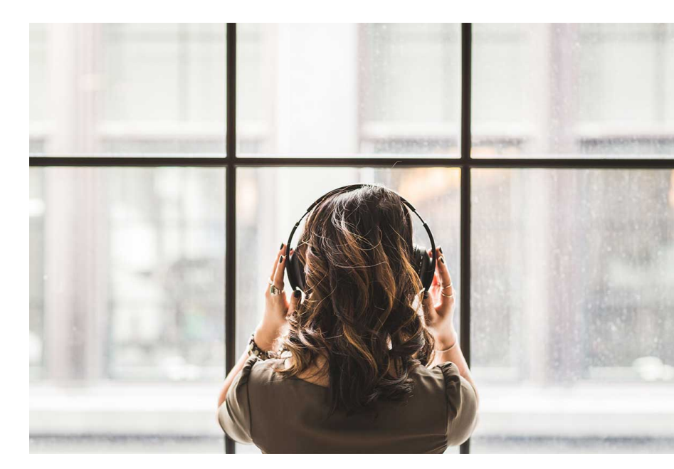
LISTEN ON SPOTIFY

Listen to our curated Spotify playlists.