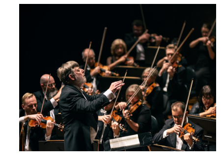
APRIL 15, 2020 CLASSICAL MUSIC, ORCHESTRAL MSO "HIBERNATES" ITS MUSICIANS