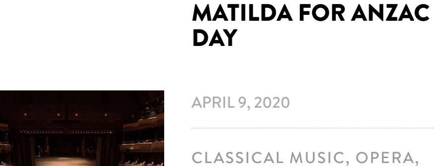
APRIL 9, 2020