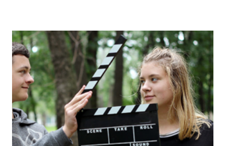
HOMECASTS APRIL 3, 2020