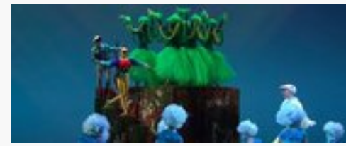
VIDEO: Royal Opera House's PETER AND THE WOLF