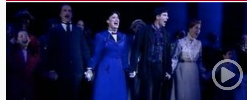
Broadway Rewind: MARY POPPINS is Practically Perfect in 2006!