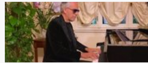
VIDEO: Andrea Bocelli Performs 'Con te partiro'