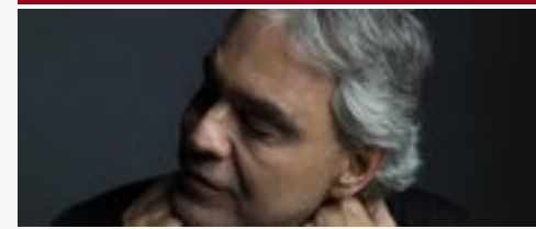
Bocelli Will Stream Performance From The Duomo In Milan On Easter